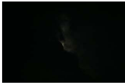
Jul 22, 7:58:10 AM DST: We again found the sun.