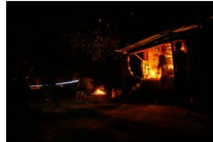
Jul 21: temporary stalls for our snacks.

At 4:00 PM DST, Farukee and I started for our desired location. We gave the coordinate in our GPS as the next waypoint and started driving our SUV to find the spot. While driving, we asked some