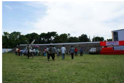
Jul 21: At Panchagor stadium, My SUV parked at right. Where Diganta Channel's SUV at left.