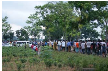
Jul 22, 6:24 AM DST: People are gathering to observe