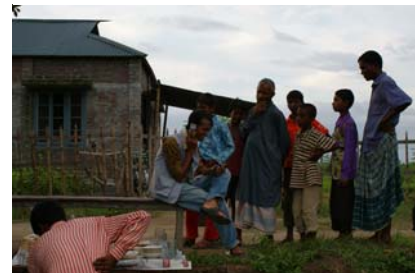
Jul 21: I am informing my family about my arrival at destination. To my left, it is the office building of the tea estate and the shed was our observation place.