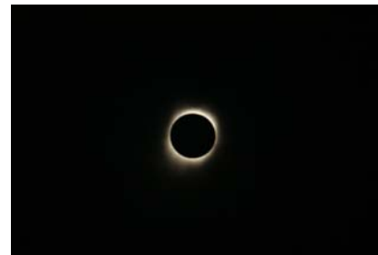
Jul 22, 7:59:58 AM DST: This is what we all were waiting for.