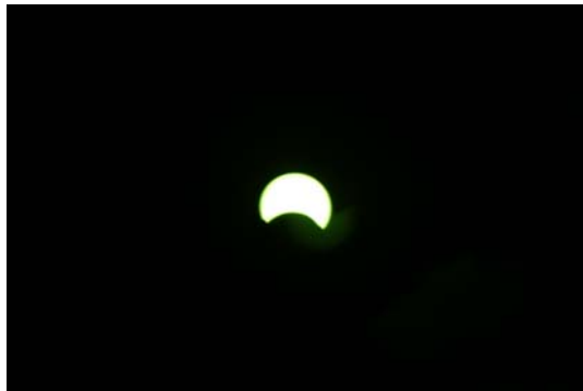
Jul 22, 8:33:36 AM DST: The moon is moving away from the sun.

hand with me to setup the equipments. We brought all of our tripods, cameras, portable chair with the laptop, filter, etc to the observation spot. We were completely ready and the heart was beating. But we were anxious and worried as there were thick and dense clouds. There was no way of the visibility of the sun. We all were waiting for the sunrise time. The time passed, and we understood the sun had risen though no sign of the sun. So many people were waiting for the little glimpse of the sun. I was watching my cell phone's clock for the starting time of the eclipse.