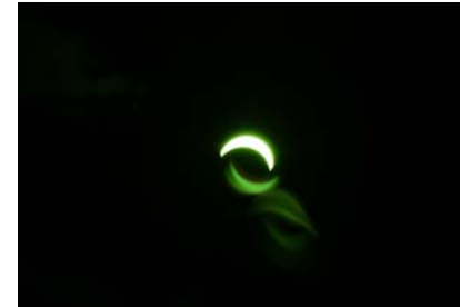
Jul 22, 8:05:26 AM DST: The moon is moving away from the sun.

About 4:30 AM DST and still people were coming. There were a parking lot established for temporary basis and people were parking their vehicles there. Though my SUV was parked just beside my