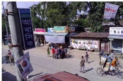
Jul 21: My SUV at Panchagor.