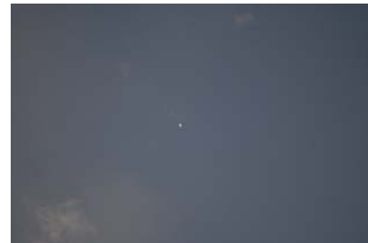
Jul 22, 7:53:26 AM DST: We first saw a star.

to have some biscuit, peaju, etc as our dinner. Suddenly the NSI guy came and asked about the dinner. We told him about our plan and asked his favor to send someone to bring eggs for us. He assigned a local guy to bring the eggs for us, where the guy suddenly invited us for the dinner in his residence. Lucky us.