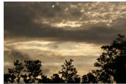
Jul 22, 7:28:16 AM DST: Eclipse already started. But dense cloud.