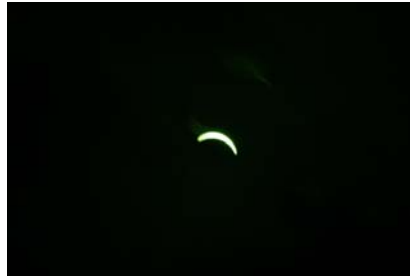
Jul 22, 8:01:08 AM DST: The sun is coming out

I talked to the manager of the tea estate and he agreed to allow me to do my works on our selected place. My plan was to work minutely because under any circumstance, I was not interested to miss any thing. If I missed, I would miss it for the rest of my life. And the exact focal point was reserved for the researchers from Astronomical Society. So I was not interested to go there and interfere in there work. I stayed 60 meters west from the exact focus and since it was under my tolerable range (100 metres), I was fully satisfied working here.