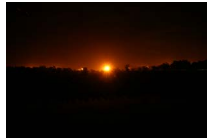
Jul 21: The search light of Indian Border.