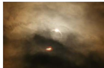
Jul 22, 8:00:20 AM DST: One of my best shot ever.

from my SUV and astonished when saw so many people are coming to the place. On foot, rickshaw van, bicycle, motorcycle, even sedans. It was telling me how much interested the mass people were about the TSE2009.