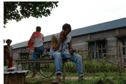
Jul 21: I am taking a tea break at the final destination.