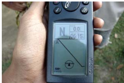
Jul 21: We are only 62m away from the exact focal point.