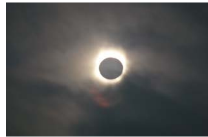
Jul 22, 8:00:14 AM DST: One of my best shot ever.