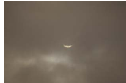
Jul 22, 7:48:54 AM DST: Suddenly the first glimpse.