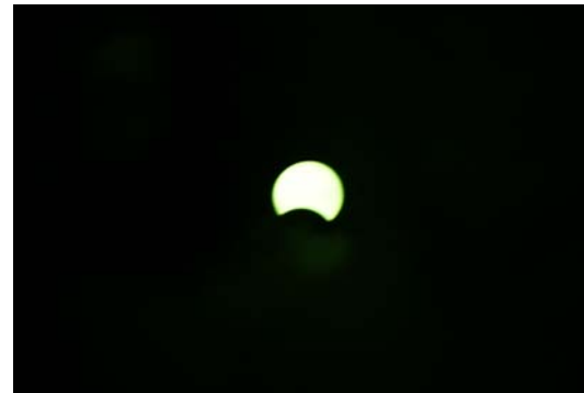
Jul 22, 8:42:22 AM DST: My last shot.

I was full time standby with my setup, no matter what weather condition it was. And I planned to stay till the last. We all were looking to the sky with very anxiety. It was at 7:48:54 AM DST