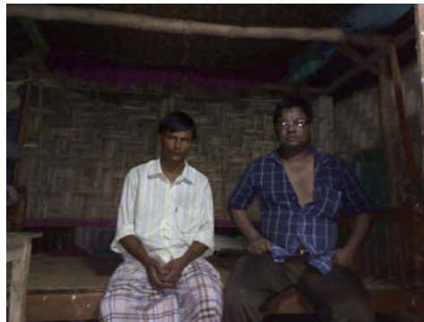
Jul 21: The guy who invited us for dinner in his home.

Finally after a lot of tough driving, hard work and explore, we found a road and also found that our GPS is indicating a decreasing in distance between the spot and us. We continued to follow that road and finally we got almost near, around 200 metres of the focus point. We finally parked our SUV beside the M.M. Tea Estate's site office and hopped down from the SUV. Farukee and I started to find the exact point using our GPS holding on our hand. The GPS was indicating the position with an error radius of 7 metres. We found that we are around 62 metres from the focal point. But that time it became really hard for us to find the