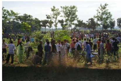
Jul 22, 8:03:28 AM DST: The special lighting effect after the diamond ring.

About 4:30 AM DST and still people were coming. There were a parking lot established for temporary basis and people were parking their vehicles there. Though my SUV was parked just beside my