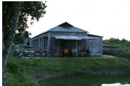
Jul 21: Our observation place selected.

At 4:00 PM DST, Farukee and I started for our desired location. We gave the coordinate in our GPS as the next waypoint and started driving our SUV to find the spot. While driving, we asked some