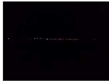
Jul 22, 4:30 AM DST, People are coming.