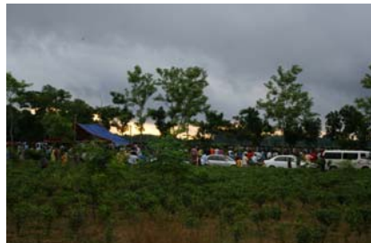
Jul 22, 6:52:50 AM DST: Everybody is ready, but bad weather. To the left of the microbus, it was the prime focus.