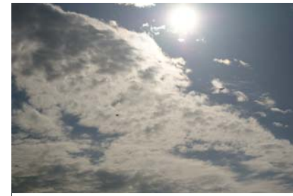
Jul 22, 8:06:04 AM DST: The moon is moving away from the sun. Birds are confused.

observation place. Still I thank to the some of the local people, employees of the tea estate and the NSI guy for their kind helping hand to make the place for my observation.