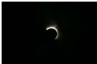
Jul 22, 7:58:28 AM DST: The Eclipse